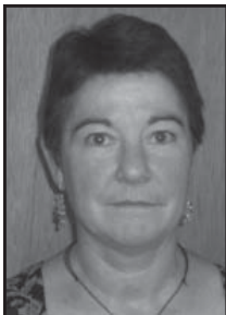
Exhibit Entry Information

All exhibits must be pre-registered by July 27, 2009. Go to www.WesternMontanaFair.com and click the link titled "Enter Exhibits". If you do not have Internet, the Fair Office will assist you. Parents must sign if exhibitor is under 18 years of age. There will be an electronic signature box for this verification at the Online Entry System screens. For complete step-by-step instructions go to pages 36-37.